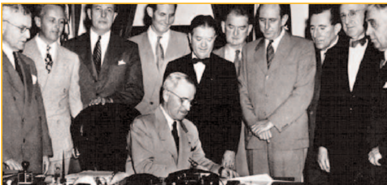
At the White House, members of Congress watched as President Truman signed the Legislative Reorganization Act on August 2, 1946.

Dynamic legislative process tool makes clear how a bill becomes a law.